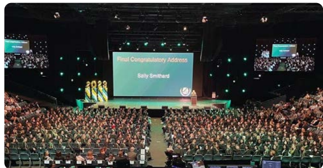
Year 12 Graduation