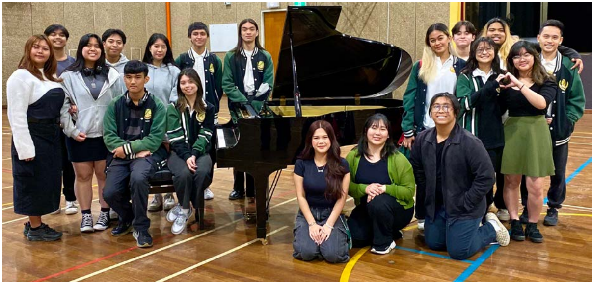
HSC Music 1 Cohort 2023

Drama was next up in Week 7 with our twenty-three Drama students submitting their Individual Projects and presenting their Group and Individual Performances to a team of three HSC markers, completing 60% of their HSC Examination. As stipulated by NESAs, our students performed these exam pieces in front of an audience of no more than thirty people, consisting of the lucky Year 11 Drama cohort and their teacher. Drama is the only HSC course that has a compulsory group component for their examination and the only performance course that requires an audience.