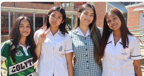
Past VS Future Day