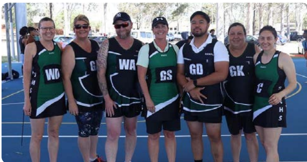
Students VS Teachers Netball Game

Finally, on Thursday and Friday, Year 12 students attended their Grad Rehearsal and Graduation (held at Hillsong Convention Centre), marking their final days as high school students with emotional farewells and congratulations. Joined by family and friends, Year 12, Class of 2023 said goodbye to thirteen years of schooling and entered the next chapter of their lives.