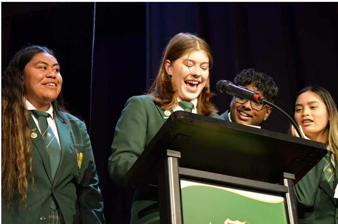
The 2023 Captains and Vice Captains announcing the 2024 Captains and Vice Captains.

Congratulations to all our award recipients for 2023 - your hard work and dedication have truly paid off.