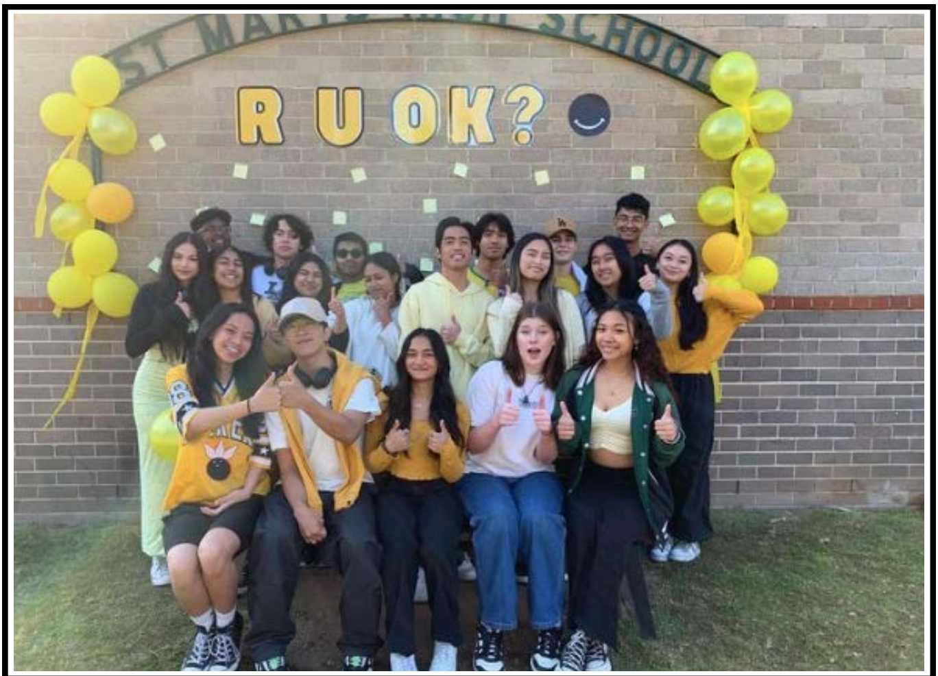
St Marys Senior High School Captains and SRC.

Overall, it was a great day to not just spend time with friends, but support them too, whether it's for upcoming HSC examinations or personal matters. Great job to everyone who took part in the school event, and a big thanks to all SRC members who contributed both time and effort into putting everything together, as this day wouldn't have been possible without them.