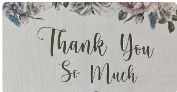
Student-Teacher Appreciation Day