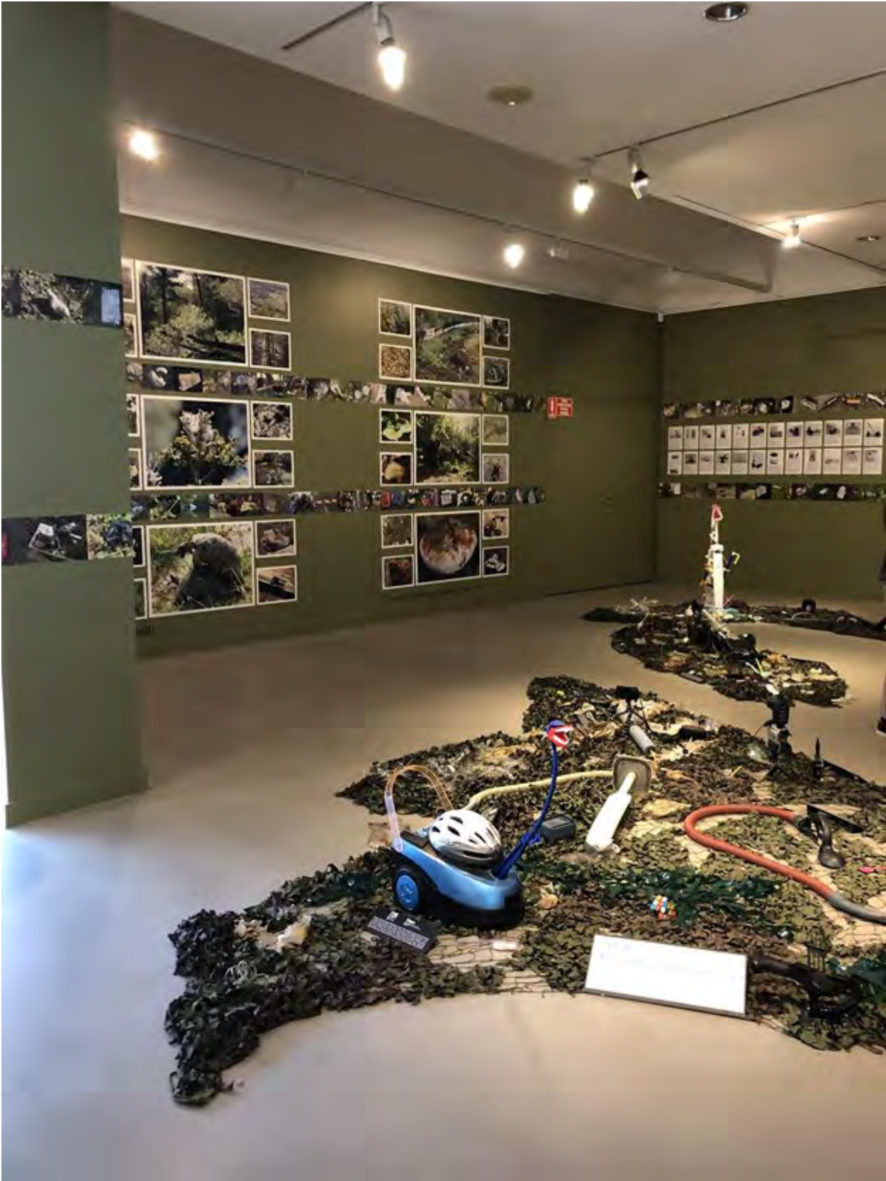
Mente Manuque – With mind and hand