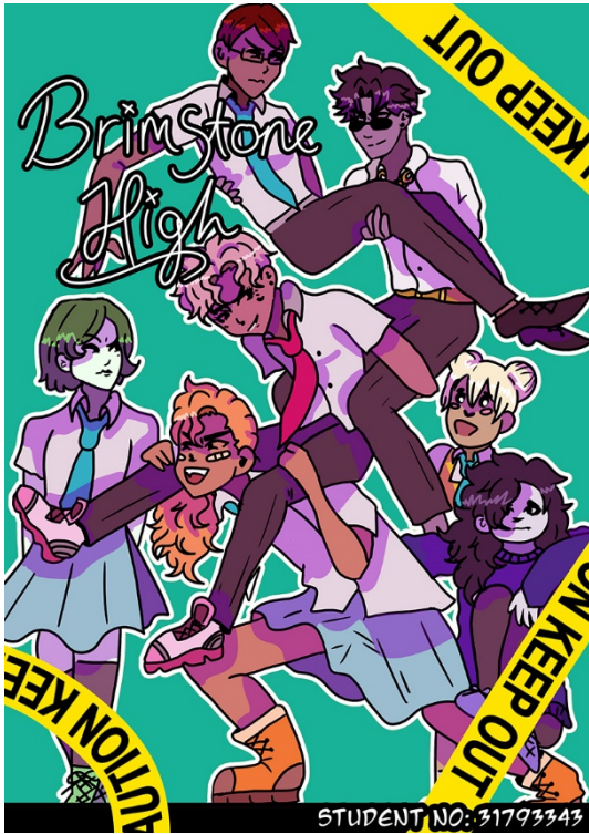
Holly Stevens 'Brimstone High'