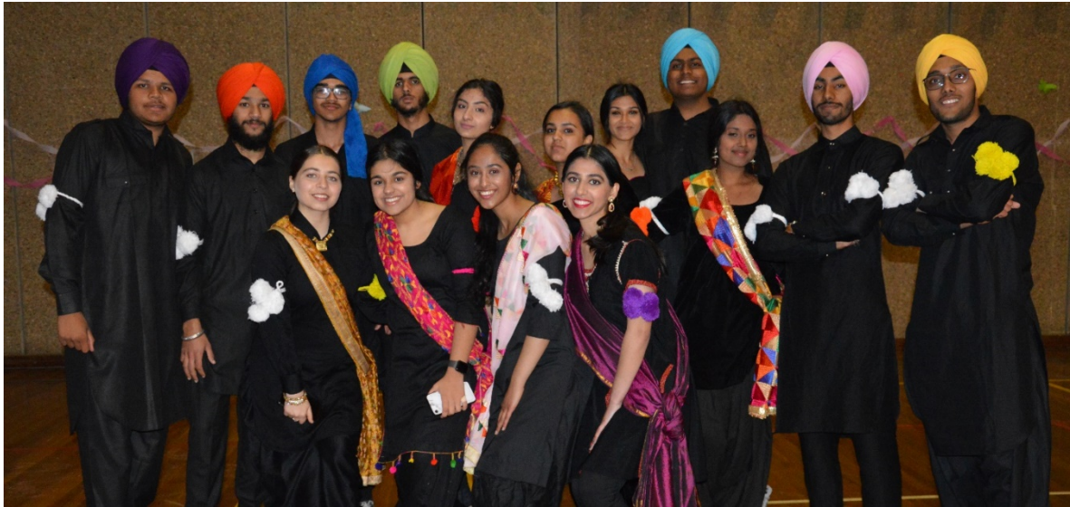
Mente Manuque – With mind and hand