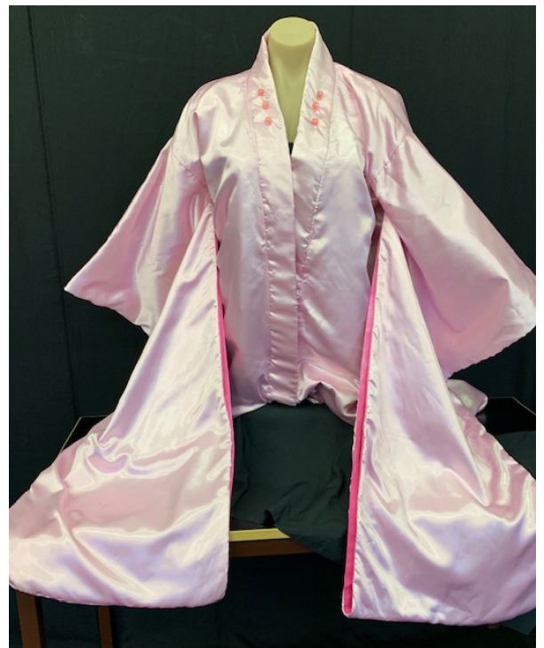
By Sofia Compos