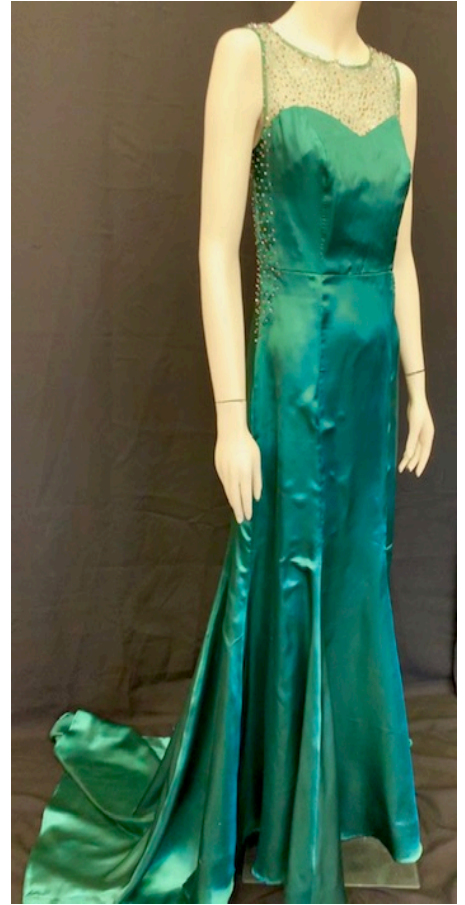
By Salima Nazari