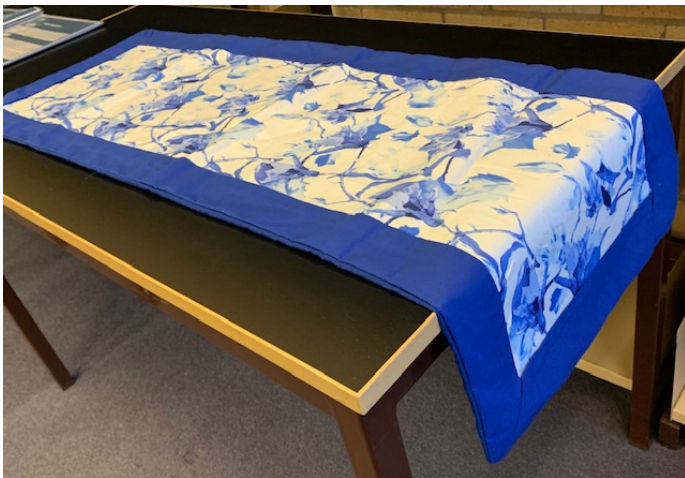
By Tuqa Al-Obaidi