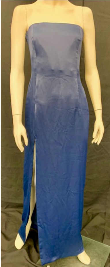
By Monique Van Schelven